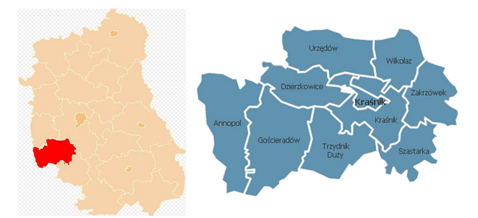
Fig. 1. Map of the Lublin Province featuring Kraśnik County and its communes [www.portalgospodarczy.eurzad.eu]

development pattern and hamlets. The smallest group are the villages with dispersed and irregular development patterns and the villages with concentrations of single farmsteads located outside the main village area.